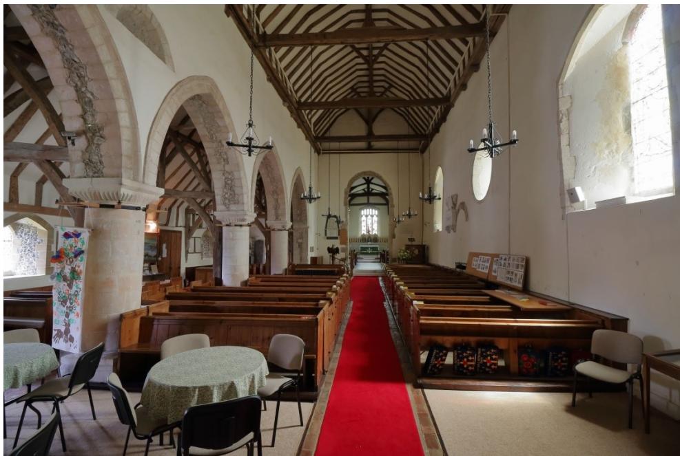
Internal View West to East