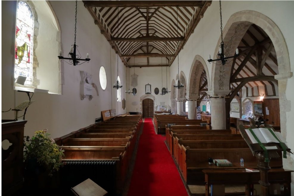
Internal View East to West